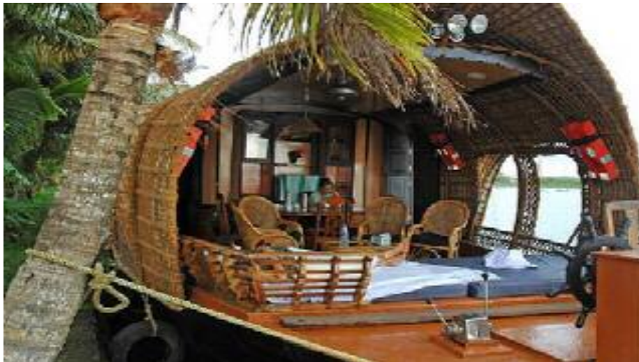
Rice Boat Interior

The canals and lagoons are lined by swaying palm trees and Chinese Fishing Nets , cooled by a gentle breeze, and studded with water hyacinths. All kinds of craft ply these waters ferrying cargoes of spice, rice, nuts, coir (coconut fibre), copra (dried coconut) and people.