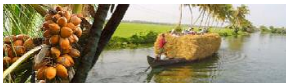
Kerala's Stunning Backwaters