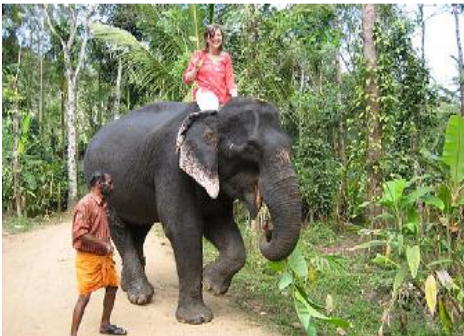
Elephant Back Ride At Kumily

You may if you wish, go on an Elephant Back Ride that is a very popular excursion at the spice growing village of Kumily .