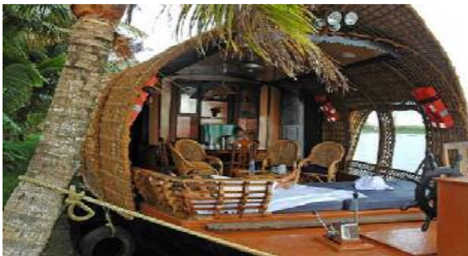
Rice Boat Interior

The canals and lagoons are lined by swaying palm trees and Chinese Fishing Nets , cooled by a gentle breeze, and studded with water hyacinths. All kinds of craft ply these waters ferrying cargoes of spice, rice, nuts, coir (coconut fibre), copra (dried coconut) and people.