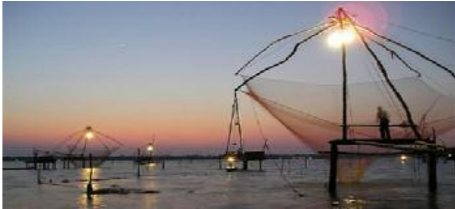
Chinese Fishing Nets At Cochin Harbour