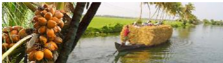
Kerala's Stunning Backwaters

Featured Hotels Dependent On Availability At Time Of Booking