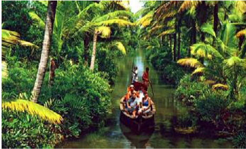
Exploring Narrow Canals By Boat