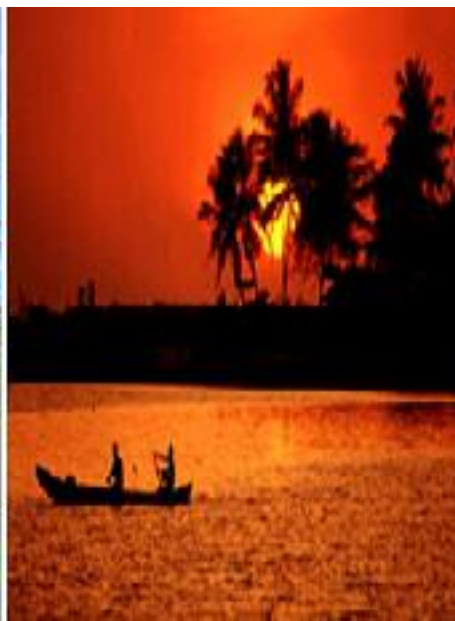
Extraordinary Natural Beauty At Kumarakom