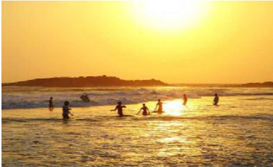
Kovalam Beach At Dusk