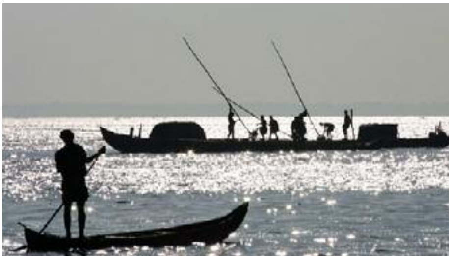
Vembanad Lake At Kumarakom