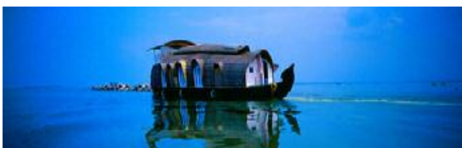
Rice Boat On Shores Of Vembanad Lake