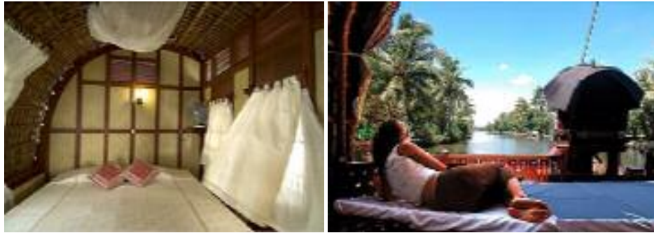
View Of Deluxe Bedroom And Backwaters Riceboat Journey