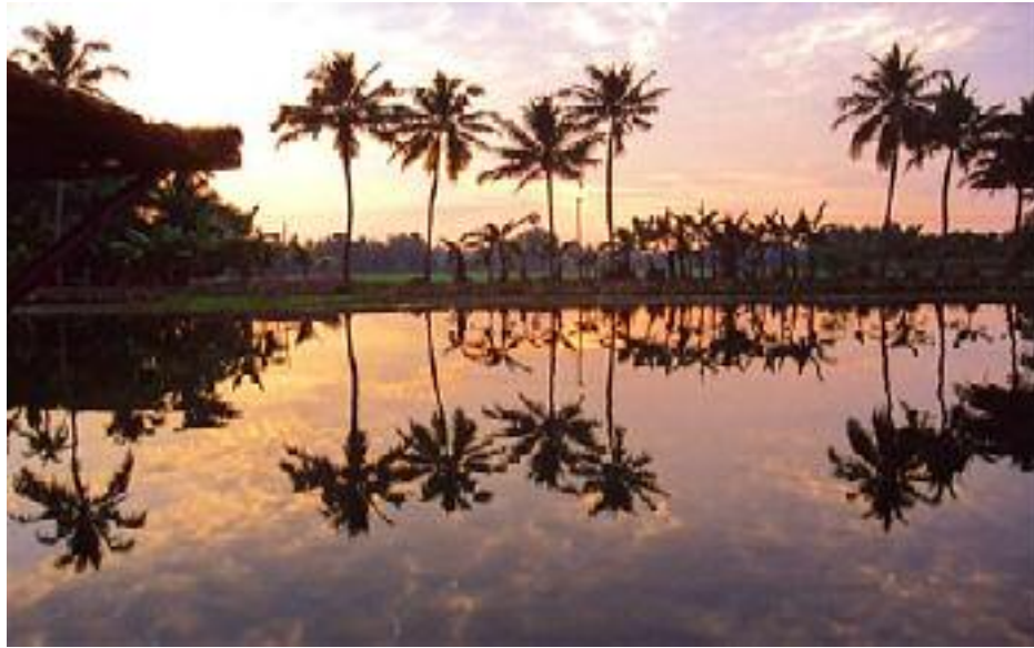
The Backwaters At Kumarakom