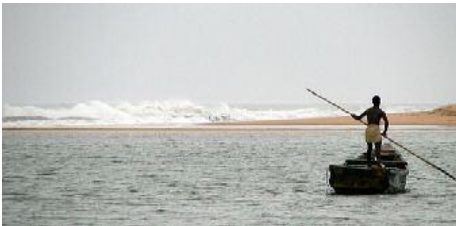
The Sandbank At Poovar

An idyllic location at the meeting point of a backwater, river and lagoon near Kovalam . Very much the place to head for a 'get away from it all' type of beach holiday.