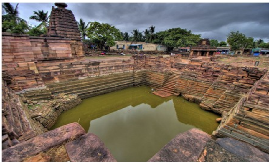
Ancient Pond At Aihole

The oldest temple here is the Lad Khan Temple dating back to the 5th Century. The Durga Temple is notable for its semi-circular apse, elevated plinth and the gallery that encircles the sanctum. The Hutchimali Temple out in the village - has a sculpture of Vishnu sitting atop a large cobra. The Revalphadi Cave - dedicated to Shiva - is remarkable for its delicate details.