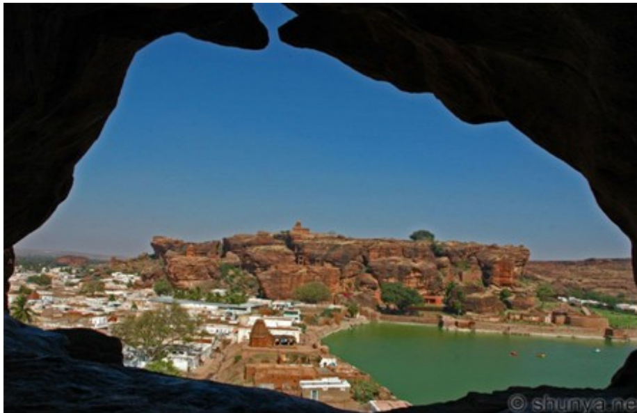
View From Badami Cave Temple

Badami lies at the foot of a rugged, red sandstone outcrop that surrounds Agastya Tirtha lake on three sides. Once the capital of the Chalukyas , Badami is best known today for its rock-cut cave temples. The caves, sculpted in the 6th and 7th centuries, depict Hindu , Buddhist and Jain iconography. Cave 1 is devoted to Shiva , Caves 2 and 3 are dedicated to Vishnu , and Cave 4 displays reliefs of Jain Tirthankaras . A natural cave nearby is dedicated to the Buddha . Carvings of Hindu Gods are strewn across the area in other caverns and on boulders.