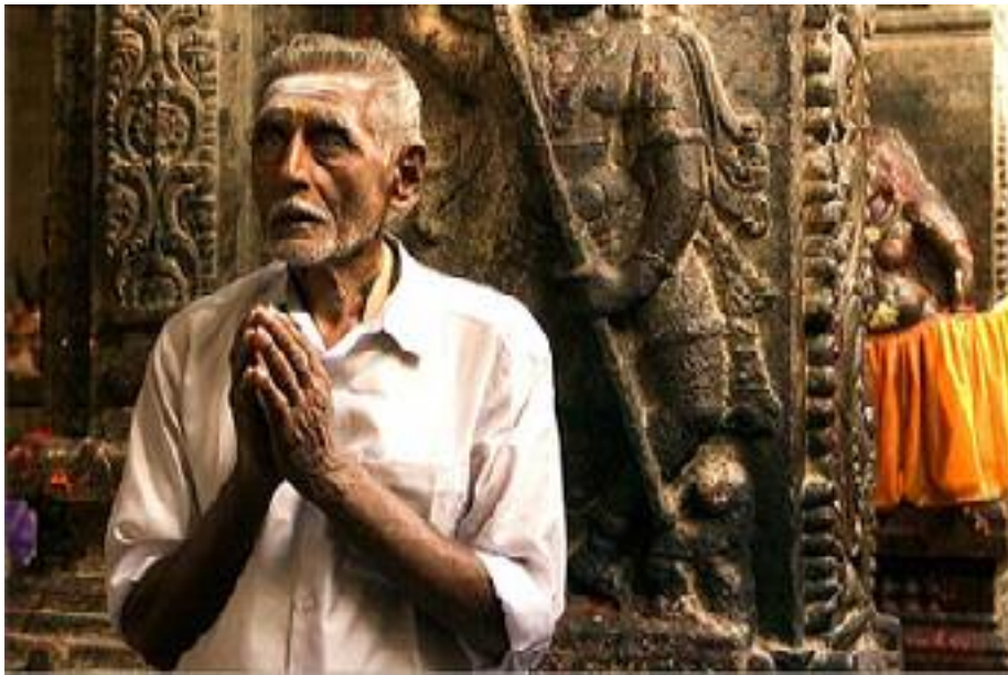
A Devotee At Sri Meenakshi Temple

Also worth visiting is The Thirumalai Nayakar's Palace (1623), a classic example of the Indo-Saracenic style of extravagant architecture. Madurai is famous for Jasmine flower sellers and spice markets that crowd the narrow streets around the main temple complex