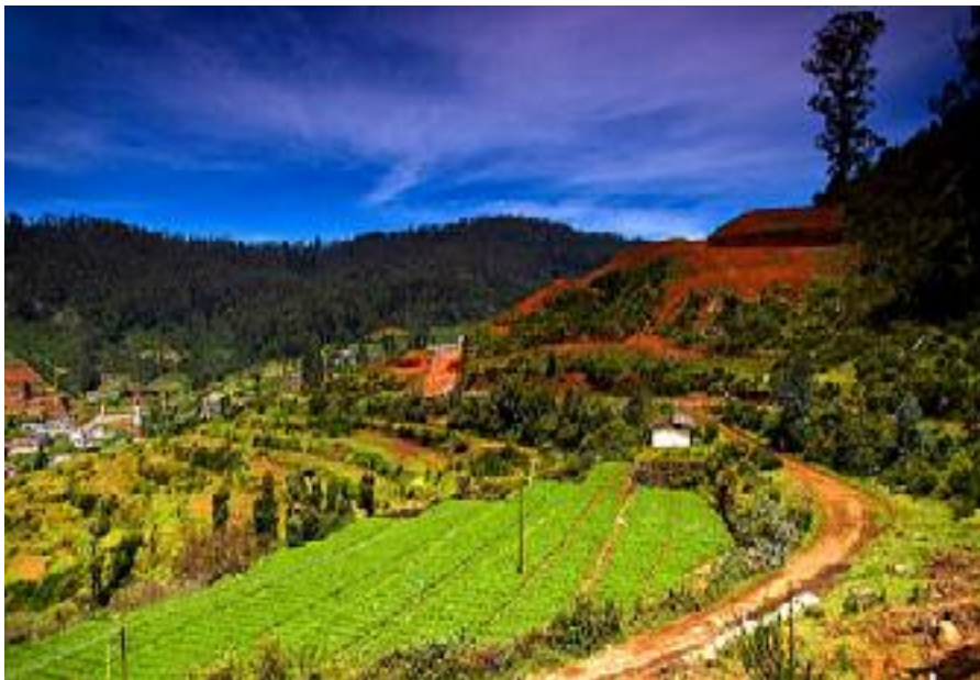
Colours Of The Nilgiri Hills

Coonoor is the second largest hill station in the Nilgiris , surrounded by tea plantations. Its climate is milder than Ooty and the weather remains pleasantly cool throughout the year.