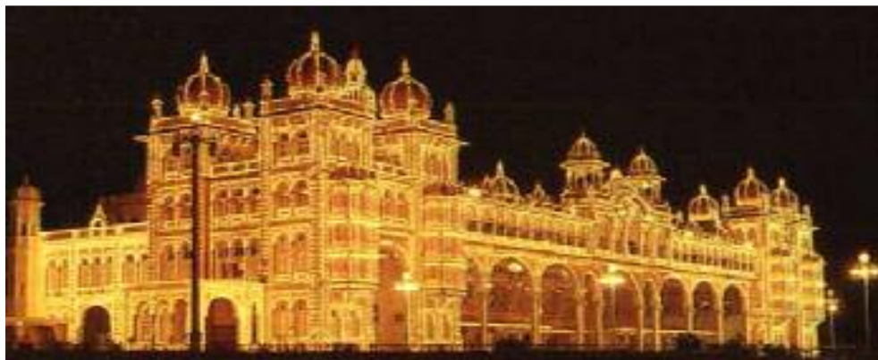
The Mysore Palace.