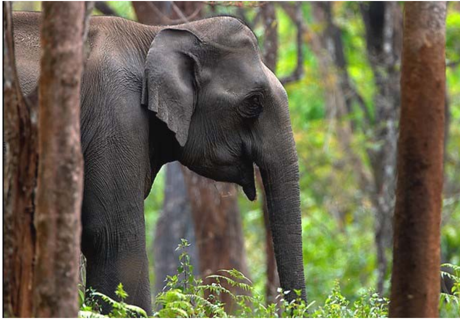
Indian Elephant In The Nagarhole Jungles