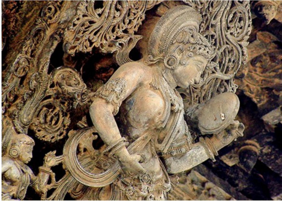
Sculptures At Chennakeshwara Temple