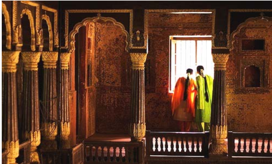
Tipu Sultan's Palace At Bangalore