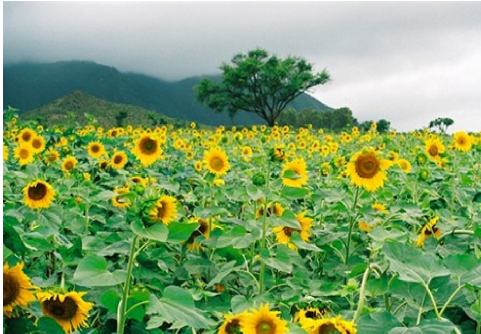
Fields Of Sunflowers At Coorg