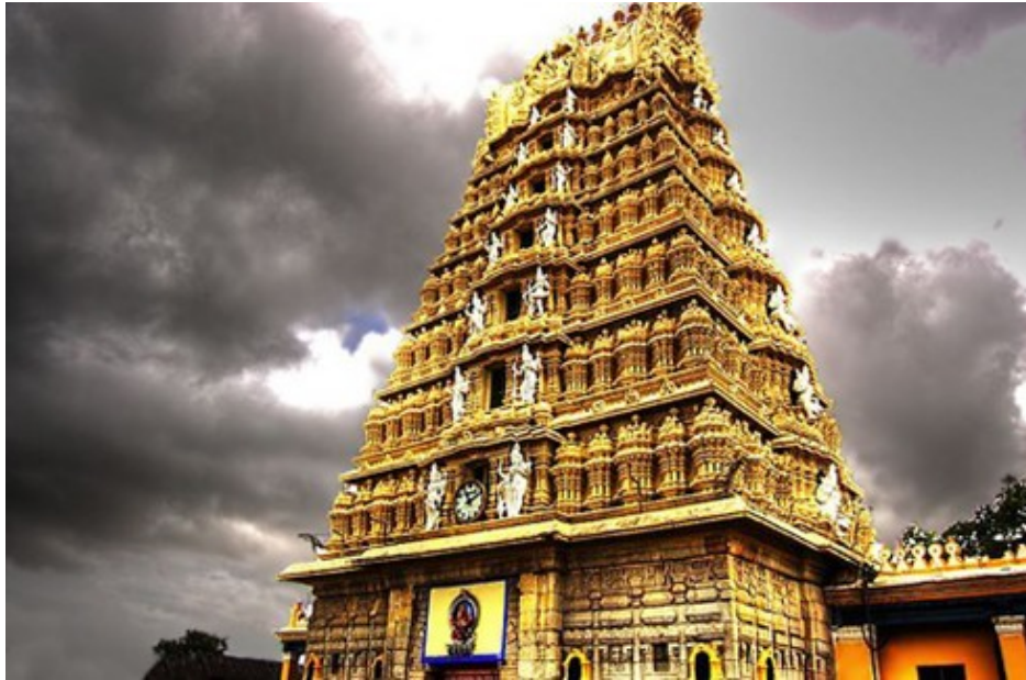
Temple On Chanmudi Hill