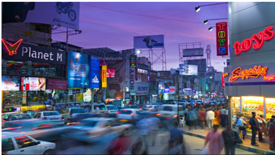
Bustling Streets Of Bangalore

The capital of the southern state of Karnataka , Bangalore today is Asia's fastest growing cosmopolitan city. It is home to some of the most high tech industries in India . It is blessed with a salubrious climate, gardens and parks. With up-market shopping malls and the best restaurants and pubs in this part of the globe, Bangalore is the ideal gateway to India .