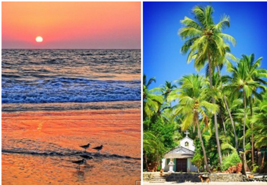
Colva And Palolem Beaches

The cuisine in Goa is exceptional. Dishes include local crab, fresh oyster, king prawns and typical Goan delicacies like Chicken Rechão and Xãcuti . The local brews, like cashew and coconut " Feni " with their strong aroma, are definitely not for the faint of heart. If you visit in the right season, you can sample the local " Urak ", a lighter and sweeter-smelling distillate of Feni .