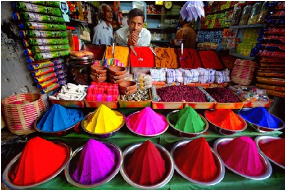
Spice Market At Mysore

Mysore also has an interesting collection of night and day markets selling spices and famous Mysore silk sarees.