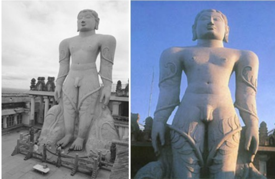
Statue Of The Jain Saint Gommateshwara