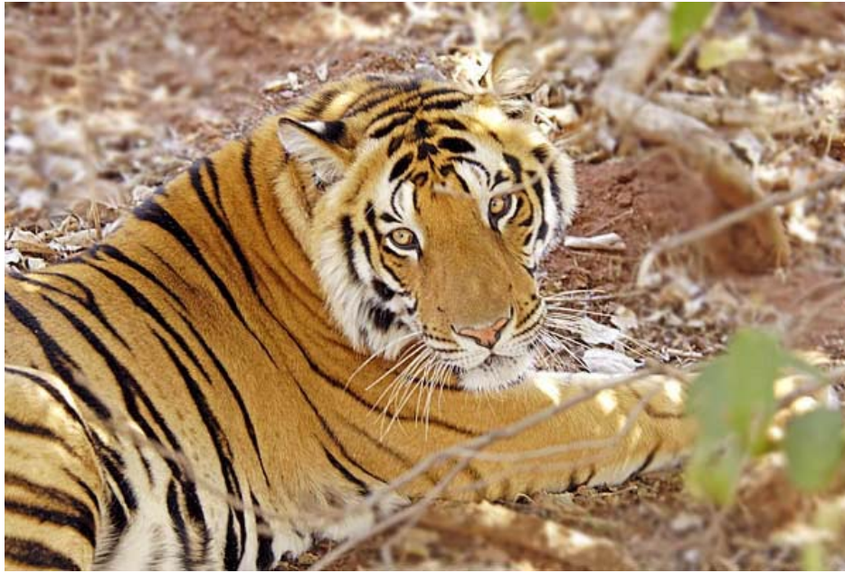
Indian Tiger At Nagarhole