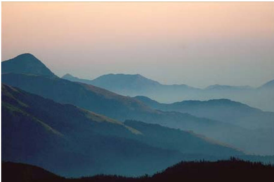
Beautiful Misty Mountains At Coorg

Many trekking routes travel through misty hills, lush forest, acres of tea and coffee and orange groves with breathtaking views.