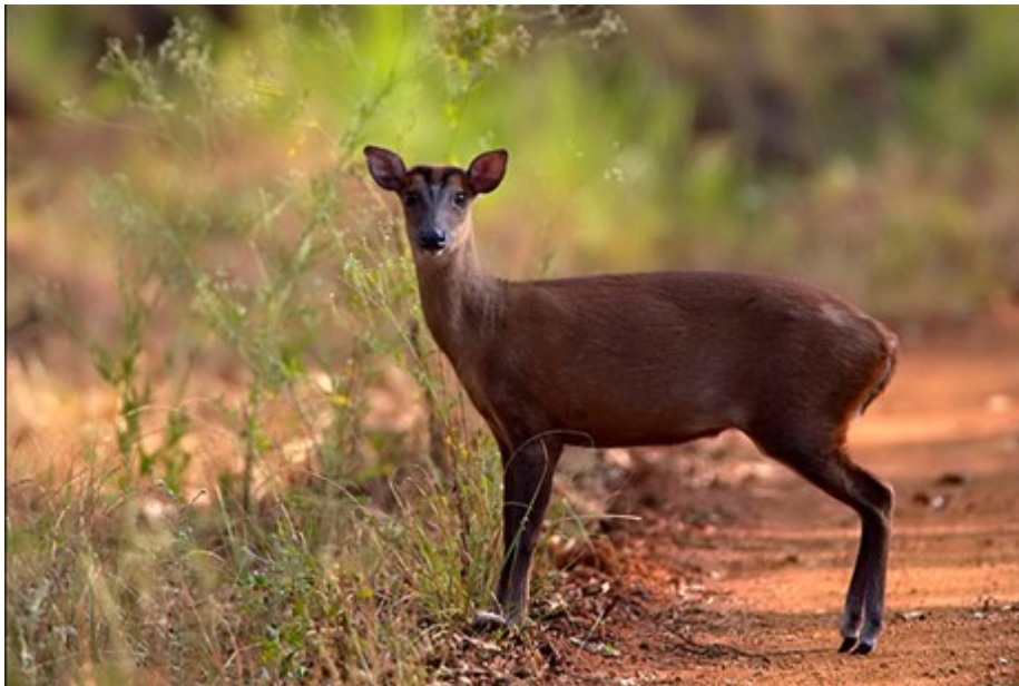
Muntjac Deer At Nagarhole

Among reptiles, the Marsh Crocodile , Monitor Lizard , Rock Python , King Cobra and several other species can be found. Aquatic and terrestrial Tortoises , Tree Frogs and a myriad insects, including some very colourful Butterflies .