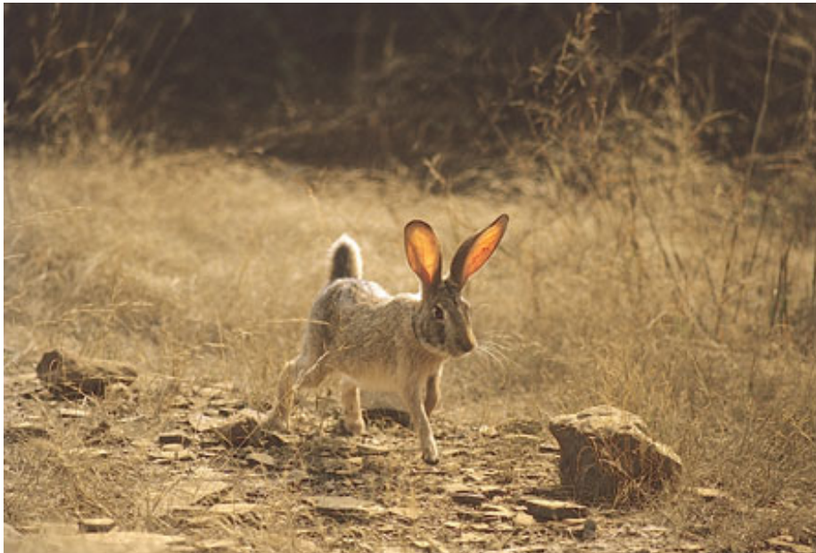
Delightful Jungle Hare At Nagarhole

Wildlife safari's are uniquely possible at Nagarhole by jeep and by boat on the lovely Kabini Lake .