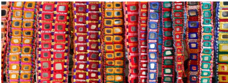
Karnataka Embroidered Fabric