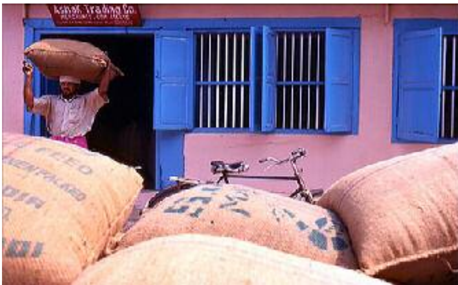
Spice Merchant At Cochin