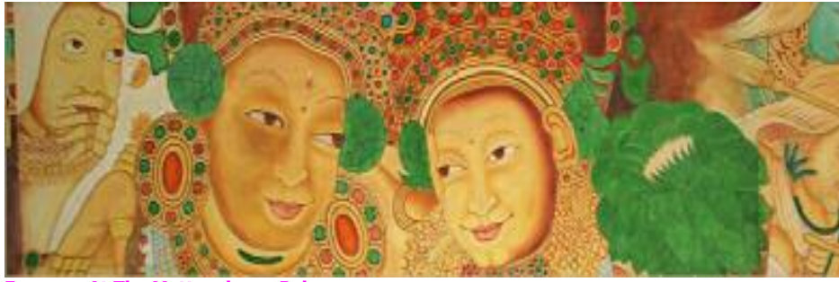
Frescoes At The Mattancherry Palace