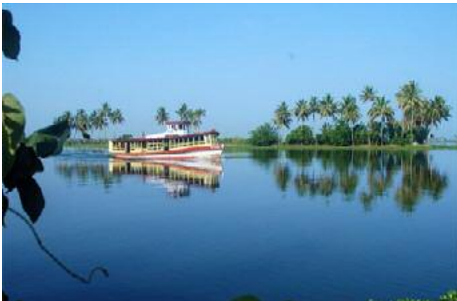
Boat Cruise On The Backwaters

The canals and lagoons are lined by swaying palm trees and Chinese Fishing Nets , cooled by a gentle breeze, and studded with water hyacinths. All kinds of craft ply these waters ferrying cargoes of spice, rice, nuts, coir (coconut fibre), copra (dried coconut) and people. The backwaters to the south of Alleppey are generally considered to be the most beautiful in the whole of Kerala .