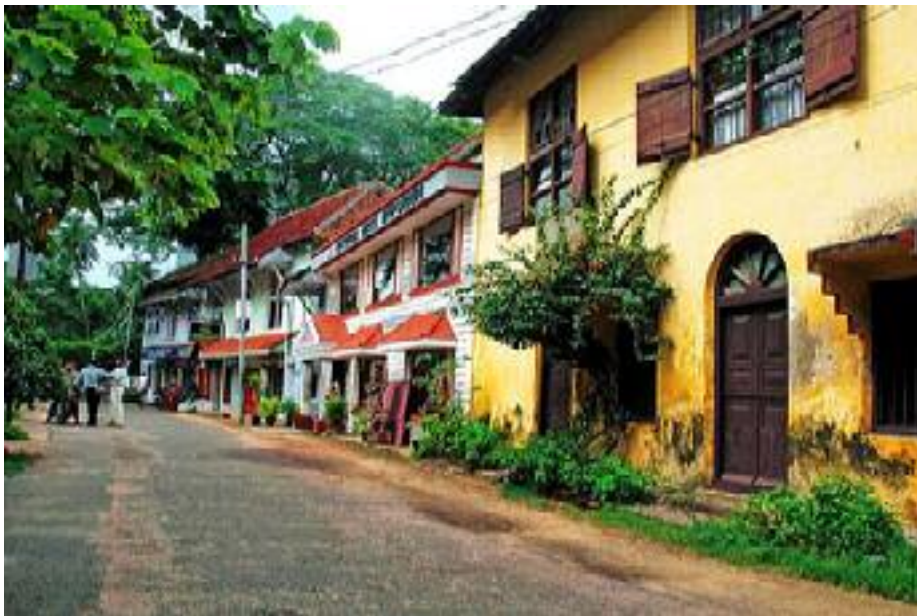
Streets Of Old Fort Cochin

The bazaars of Mattancherry and the Old Quarter are well worth a visit for their quaint shops selling everything from wooden carvings to bedspreads, from ornate mirrors to exotic spices. The Pardesi Synagogue (1568) was the focus of the famous Jewish community of Cochin , although only a handful of families remain today. Nearby is the Mattancherry Palace , which was home to the Verma Kings and today is a fine museum with some of the finest frescoes in India on display.