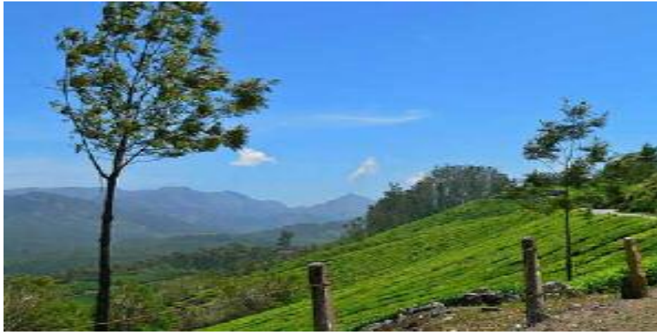
On the Road To Munnar