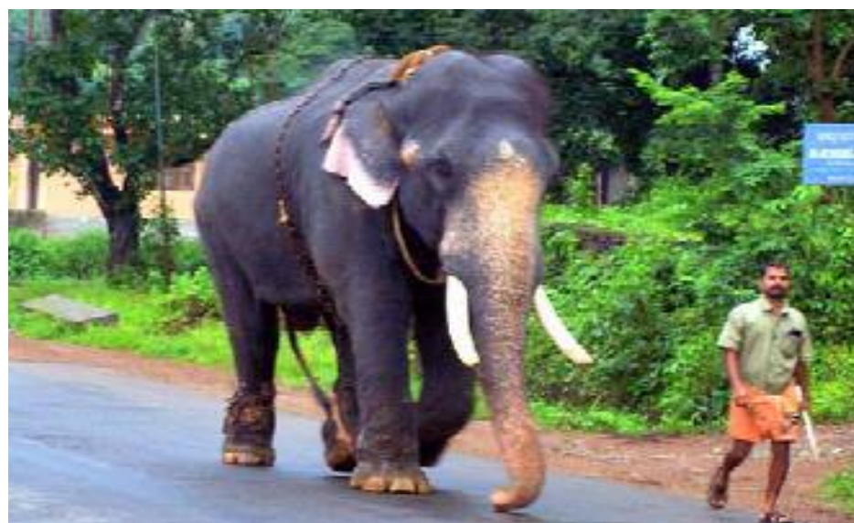
Domesticated Elephant On Kerala's Roads