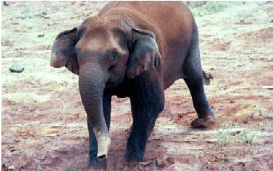
Wild Elephant At Periyar Lake Wildlife Reserve