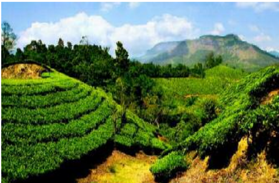
Tea Estates At Munnar

Eravikulam National Park is the last refuge of the Nilgiri Tahr . Half the world population of this rare mountain goat is found here, which is fast becoming extinct.