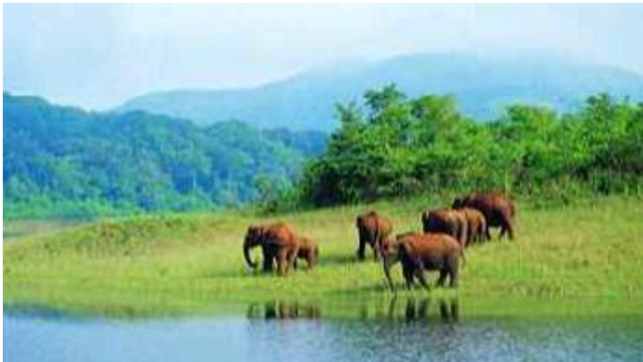
Wild Elephants Grazing By Periyar Lake

There are now, an estimated 40 Tigers and a similar number of Leopards in the reserve. Four species of primates are found at Periyar - the rare Lion-tailed Macaque , the Nilgiri Langur , Common Langur and Bonnet Macaque . Periyar also happens to be the habitat of the elusive Nilgiri Tahr , which is rarely to be seen.