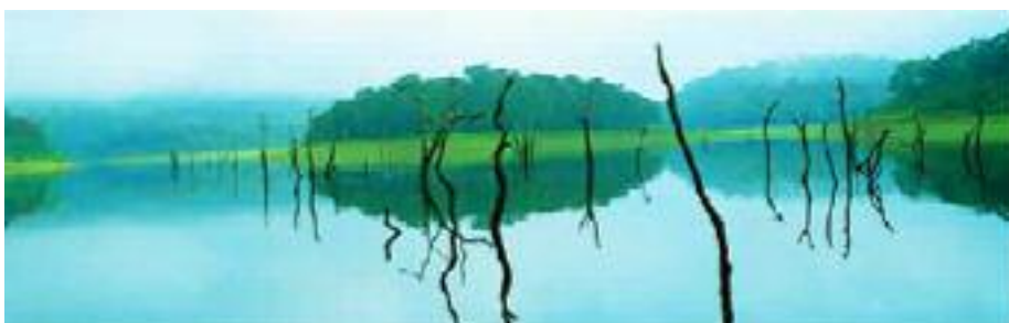
Reflections At Periyar Lake Wildlife Sanctuary