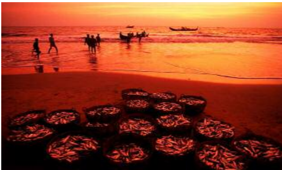
Varkala Beach At Sunset

The beaches of Kovalam have particularly shallow water during the Winter Season from October – April . It is possible to go in to the sea for up to 100 meters at waist height in certain places.