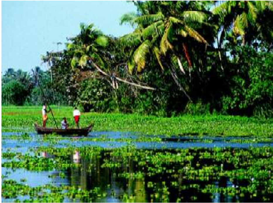
Backwaters To The South Of Alleppey