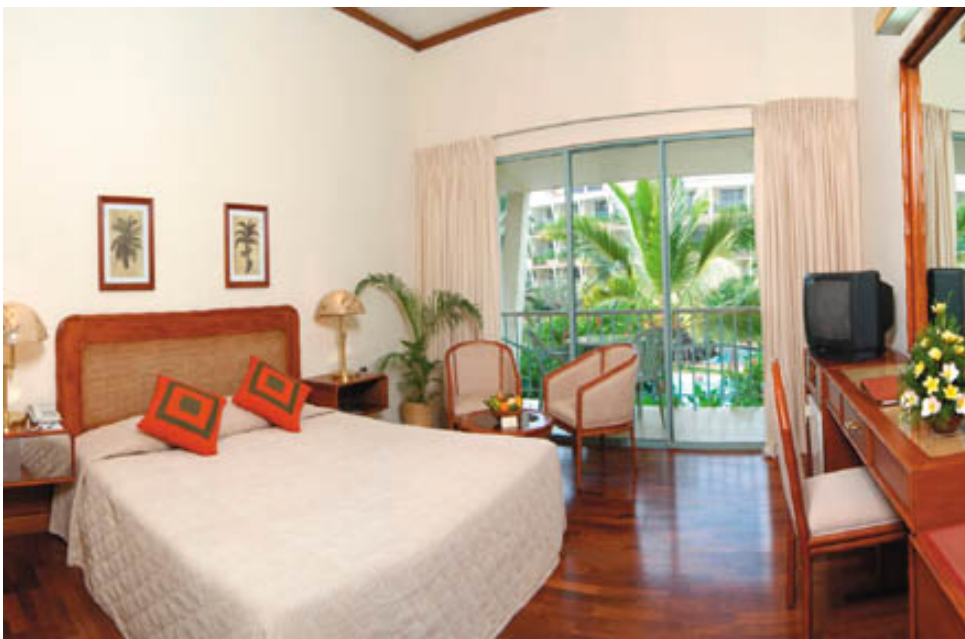
View Of Eden Standard Room

The Eden Resort And Spa is undoubtedly one of the finest 5 star beach hotels in Sri Lanka . The hotel occupies a prime site on the famous ' Golden Mile ' beach at Bentota , the island's premier resort location. The Eden Resort And Spa also incorporates the island's first purpose built health spa and well being centre and caters to a varied international clientele including a host of UK holidaymakers.