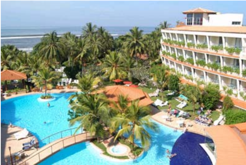
The Eden Resort And Spa Pool