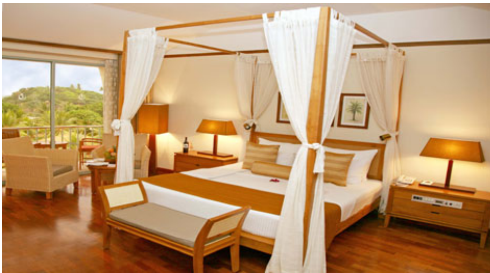
View Of Eden Paradise Deluxe Room